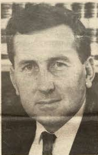
Senator Michael Tate