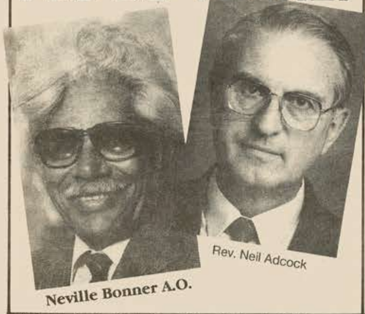
Neville Bonner A.O.