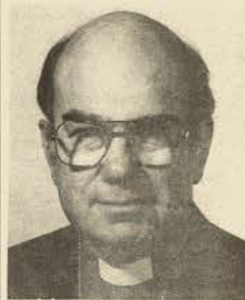
Bishop Owen Dowling