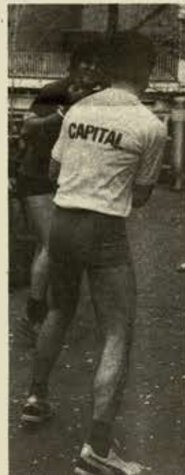
Capital 'having a go' at Labour.

The good news is, we are being heard! The politicians are taking notice. Last year's rally and white papers made quite an impact, in Canberra and throughout our nation.