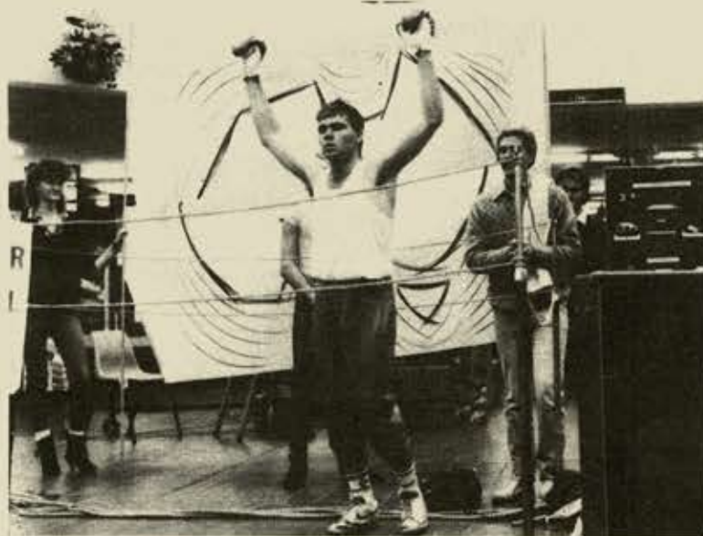
Psyching up for another round in Mornington!