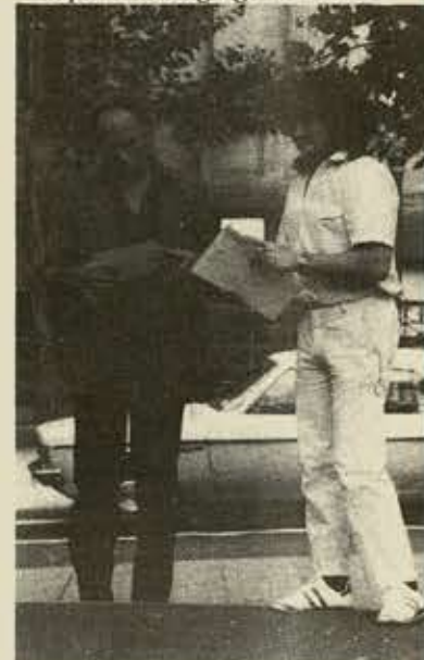
An interested passer-by in Melbourne. The outcome of the match? They all had to be carried off!